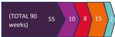
Average time (weeks) spent waiting by under 19s for eating disorders treatment