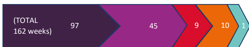
Average time (weeks) spent waiting for eating disorders treatment